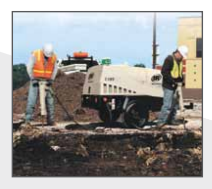
C185 is ideal for two-tool applications

The C185 is designed to provide all the power you need. With an output of 185 cfm and a pressure range of 80 – 125 psig, the C185 is an exceptional value that allows you to meet even the toughest jobsite demands.