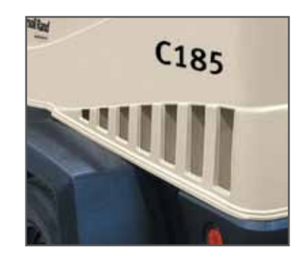
Cool-box airflow Cool air enters through the rear and washes over internal components, keeping temperatures low and prolonging component life.