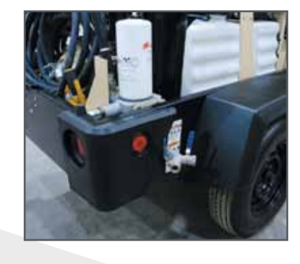
Curbside controls and service valves

The C185 is designed to provide all the power you need. With an output of 185 cfm and a pressure range of 80 – 125 psig, the C185 is an exceptional value that allows you to meet even the toughest jobsite demands.